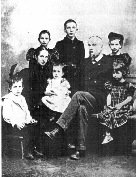
Family Group, 1898

By Spring 1898, Forel left the asylum in the hands of his successor and friend, Dr. Eugene Bleuler. Soon after [1902] Carl Jung worked as a psychiatrist under Dr. Bleuler at Burgholzli. Jung was to meet Sigmund Freud in Vienna in 1907.