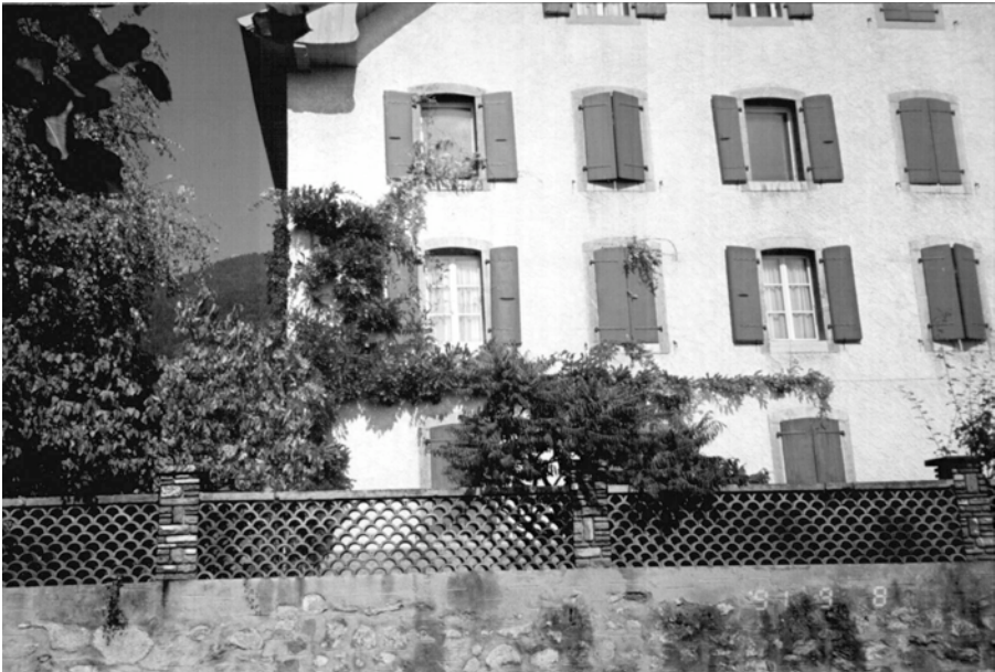
“The Ants’ Nest,” Forel’s last home, in Yvorne/Aigle, Switzerland 1903-1931

In 1903, Forel and his family moved to the village of Yvorne in the midst of vineyards near the little town of Aigle at the foot of the mountains and overlooking the Rhone valley which opens westward on Lake Geneva. Their home, which his wife called “La Fourmilere” [The Ants’ Nest], is where he lived productively his final twenty-eight years. In 1908, on the occasion of their 25 th wedding anniversary, the Forels celebrated by journeying to Algeria, Tunis, Cairo, Carthage, and Italy (Forel 264-270). Upon their return to Yvorne, Forel set out again on lecture tours throughout Europe, the Balkans, Greece and